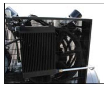
Air cooled after cooler Elite unit